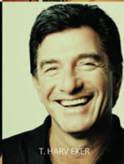
T. HARV EKER

THREE DAYS Learning to Master your Finances, Mindset, Health and Relationships