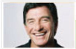
T. HARV EKER

John Gray's books about Men from Mars, Women from Venus, have sold over 50 million copies in 50 different languages all around the world. John is considered one of the leading experts in the fields of relationships and communication between men and women. His life-long passion is to help women and men to better relations, both in intimate relationships, families and at work. His presentation is filled with humor, understanding, respect and up-to-date science and statistics.